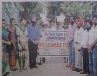
Members of rotaract clubs celebrated World Polio Day in Ludhiana.